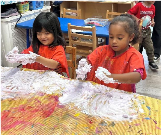
Class 2N Sensory activity