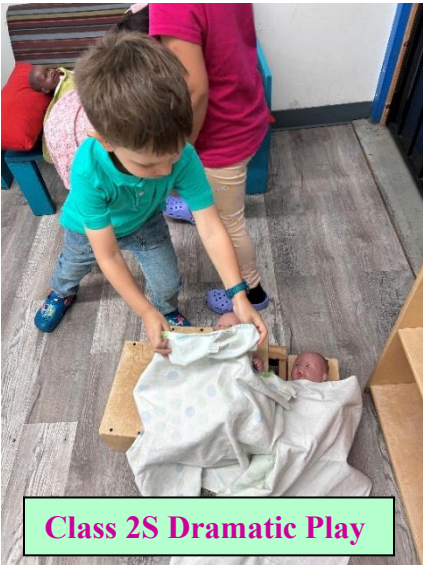
Class 2S Dramatic Play