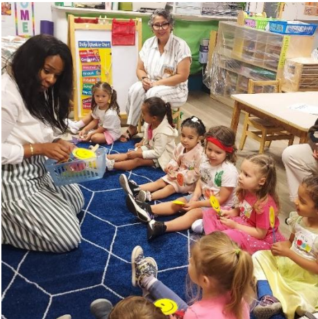
3K Morning Meeting