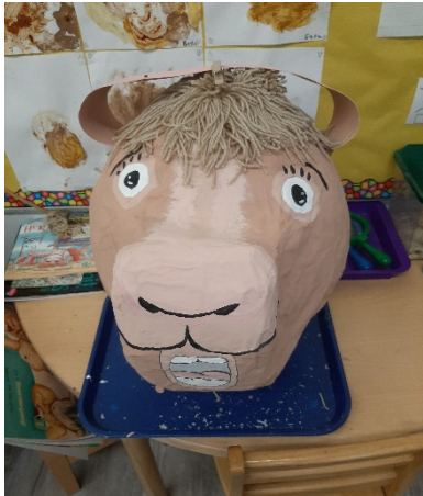
Always connecting to the larger curriculum.... Pout Pout Fish and Llama Llama

• FALL FESTIVAL: Rather than the very large, often chaotic, whole school/family weekend event we did annually before Covid, we are now breaking the fall ritual into 2 parts. Fall Family Day was a few weeks ago. Seasonal activities for the 4K kids will be held this Thurs during the school day. Kids will have a chance to decorate a small pumpkin, make their own candy apple, corn husk doll, paper hat with feathers and pom poms, and break open the pinata so carefully being made in their classrooms. More pictures to follow!